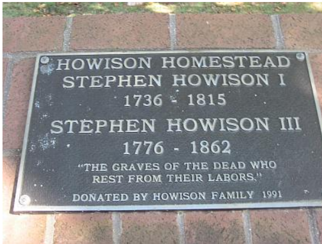
Plaque within Howison Homestead Park identifying the location of the old family homestead and its cemetery