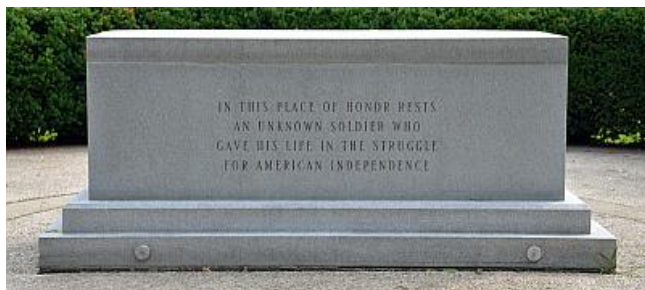
Tomb of an unknown soldier at Fr. Laurens Ohio