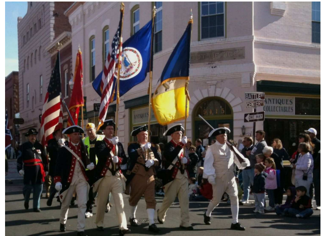
The VASSAR Color Guard marching in the First Greater Manassas Veterans Day