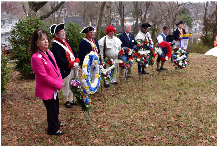
Six VSSAR Chapters and one DAR Chapter presented wreaths