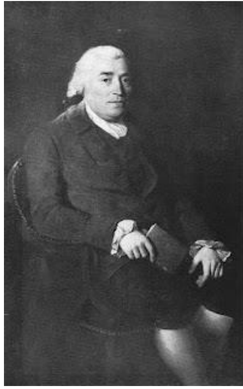
Thomas 6 th Lord Fairfax

Thomas Fairfax was created Lord Fairfax of Cameron in the Peerage of Scotland on 4 May 1627. Another Thomas, the 6 th Lord Fairfax succeeded to the title in 1709, at which time he came into the family estates in Virginia, some 5 million acres. The 6 th Lord Fairfax moved to Virginia to oversee the source of his wealth. Fairfax was the only British peer to take up permanent residence in North America.