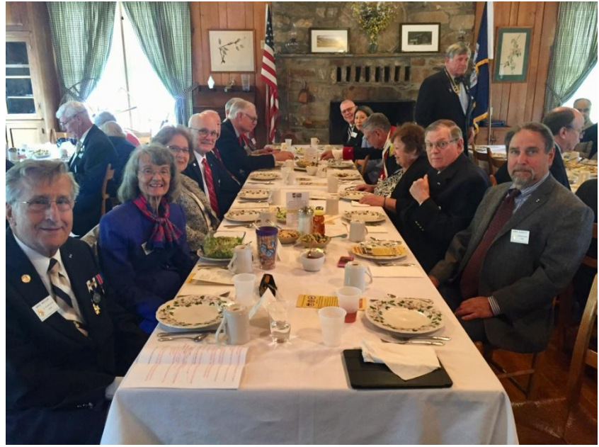
Chapter Compatriots and Spouses.