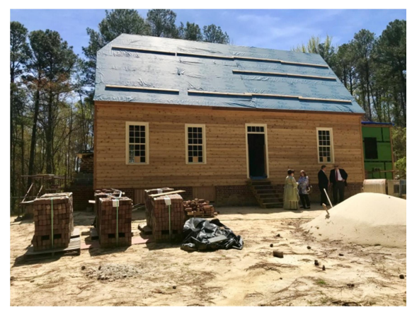
James Monroe's boyhood home; Under reconstruction.