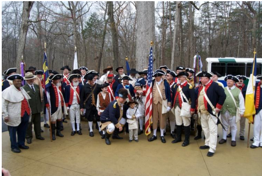
Uniformed participants at Guilford Courthouse exemplify the many variations in Rev. War Uniforms.