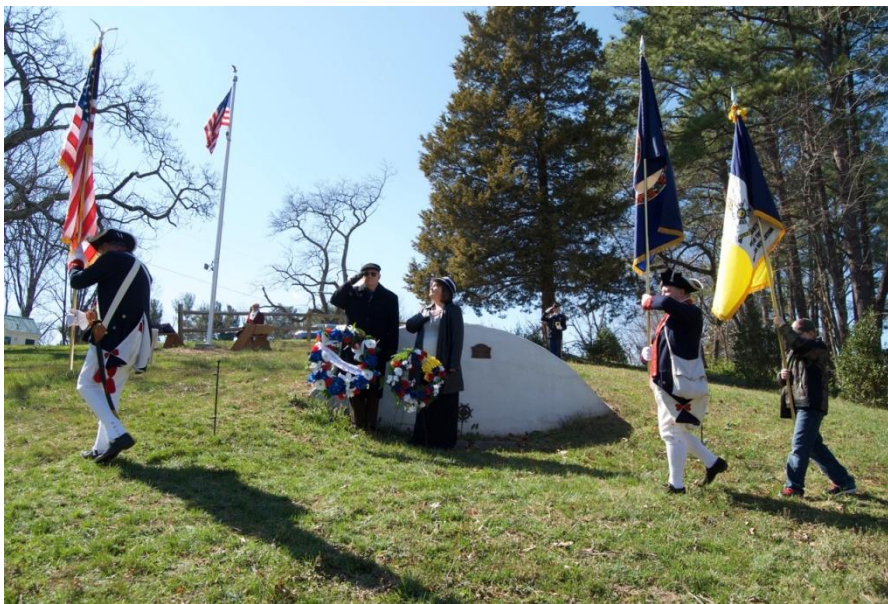
Color Guard Retiring Colors.