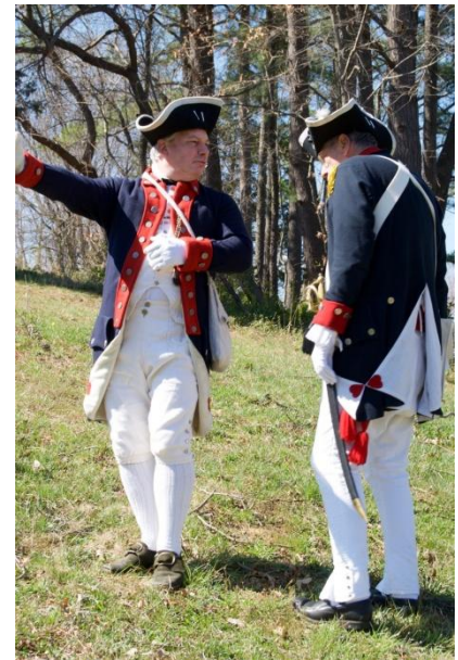
The Enemy is Over There, Sir.