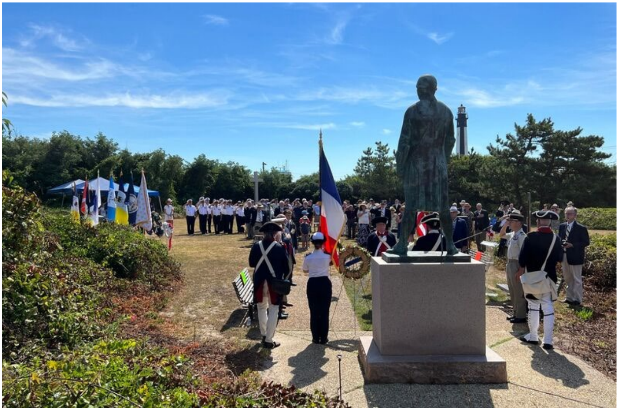
The French fleet under the command of Vice Admiral de Grasse engages the British fleet under the command of Rear Admiral Graves. De Grasse's statue is located on the