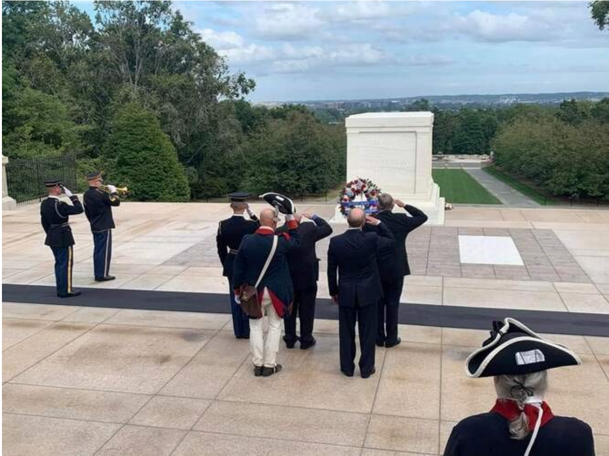
"Here Rests in Honored Glory an American Soldier Known but to God."