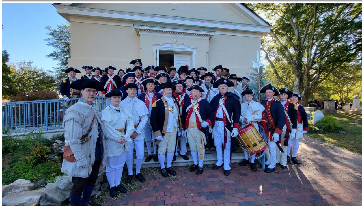
The Guard mustered in front of Grace Episcopal Church, Yorktown (built 1697)