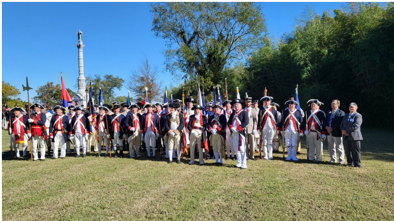
SAR Parade Unit -- Yorktown monument in background

Georgia SAR Attendees: McMichael plus 1 Compatriot.