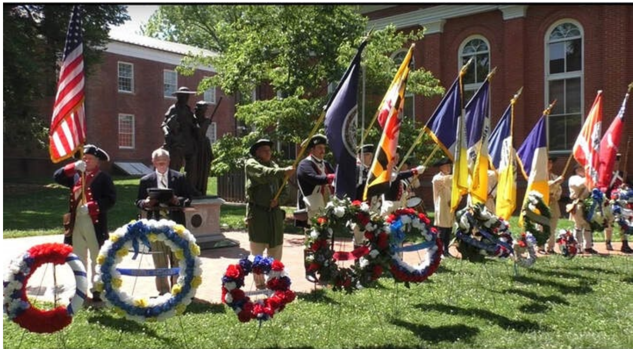
Wayne's Crossing VASSAR Ceremony