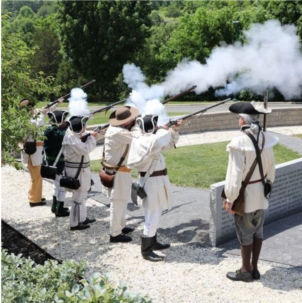
Colonel William Preston Memorial, Daleville.