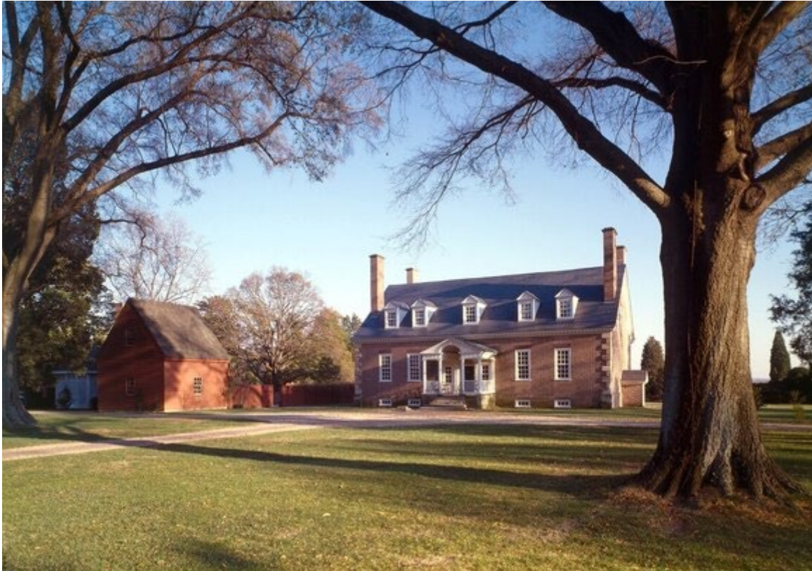
Gunston Hall (built 1759)