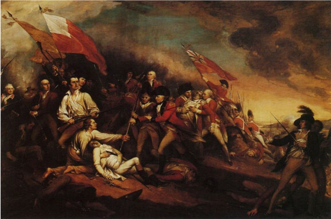
"The Death of General Warren at the Battle of Bunker's Hill on June 17th, 1775" by Patriot John Trumbull (1834)