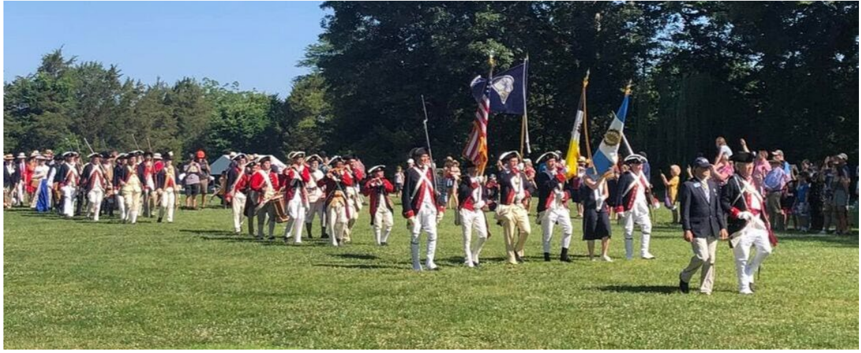
VASSAR Color Guard 2022