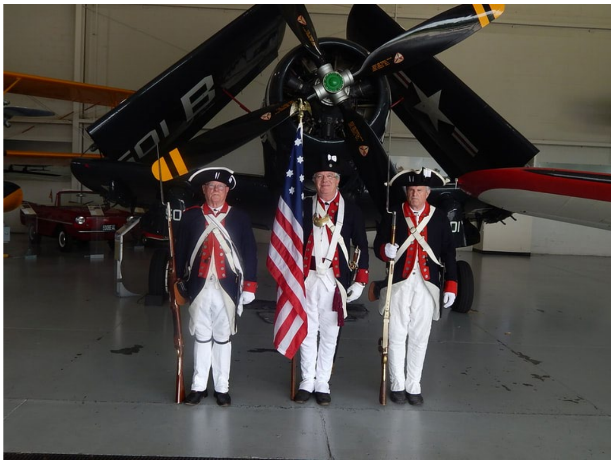
The Military Aviation Museum, Virginia Beach